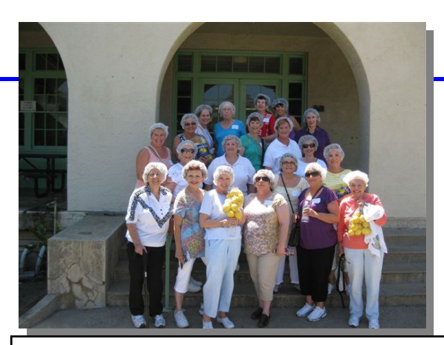
"Divas" trip to Limoneria (July 2010). We learned how lemons are packed according to size and color, using amazing computers and machinery. In The end, we got plenty of lemons to take home.

Have any news, pictures or updates to share? Please email to: Alvira alvira@woman-only.com